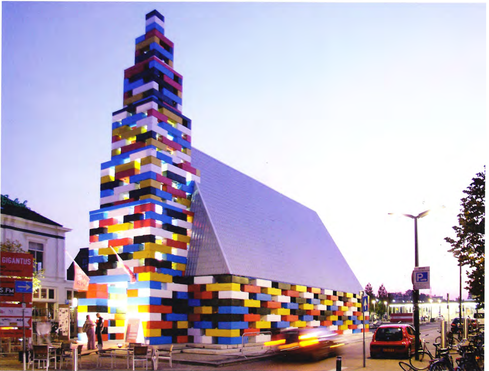
Text Fabrizia Vecchione

By assembling so-called 'Legioblocks' – concrete blocks that resemble the famous Lego bricks – Dutch collective LOOS.FM created Abondantus Gigantus, a temporary pavilion for the Grenswerk Festival in Enschede, the Netherlands. Addressing the spatiality of large-scale buildings, the group chose the form of a church, which served as a meeting point, an exhibition space and a performance venue. The vibrant landmark occupied its urban context for one week, attracting visitors thanks to a 20-m-high spire soaring to the sky.